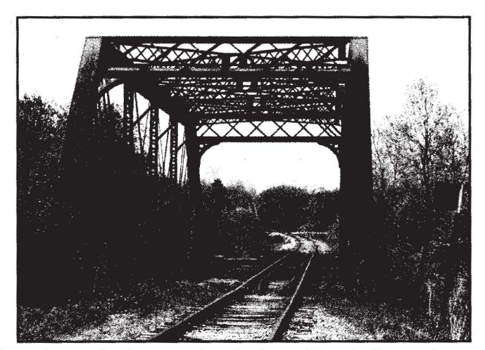
Two views of the Atlantic & St. Lawrence Railroad's steel through-truss bridge spanning the Royal River in Yarmouth, Maine. In the photo on the left, note the space on the left once occupied by a second track..

ing until 1969. The Grand Trunk line had run for over 100 years, from 1853 until 1969. Twenty years later the line was sold to the Auburn, Maine, short line and became the St. Lawrence and Atlantic Railroad.