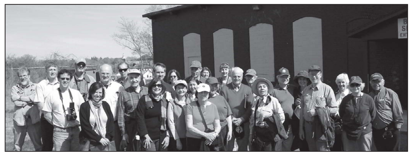
SNEC tourons in front of the SLW Storehouse No. 5. Rumor has it that there are remnants of water turbines in the cellar of this building (brought there when the mill converted to water power) and we tried to get access to them, but did not succeed.