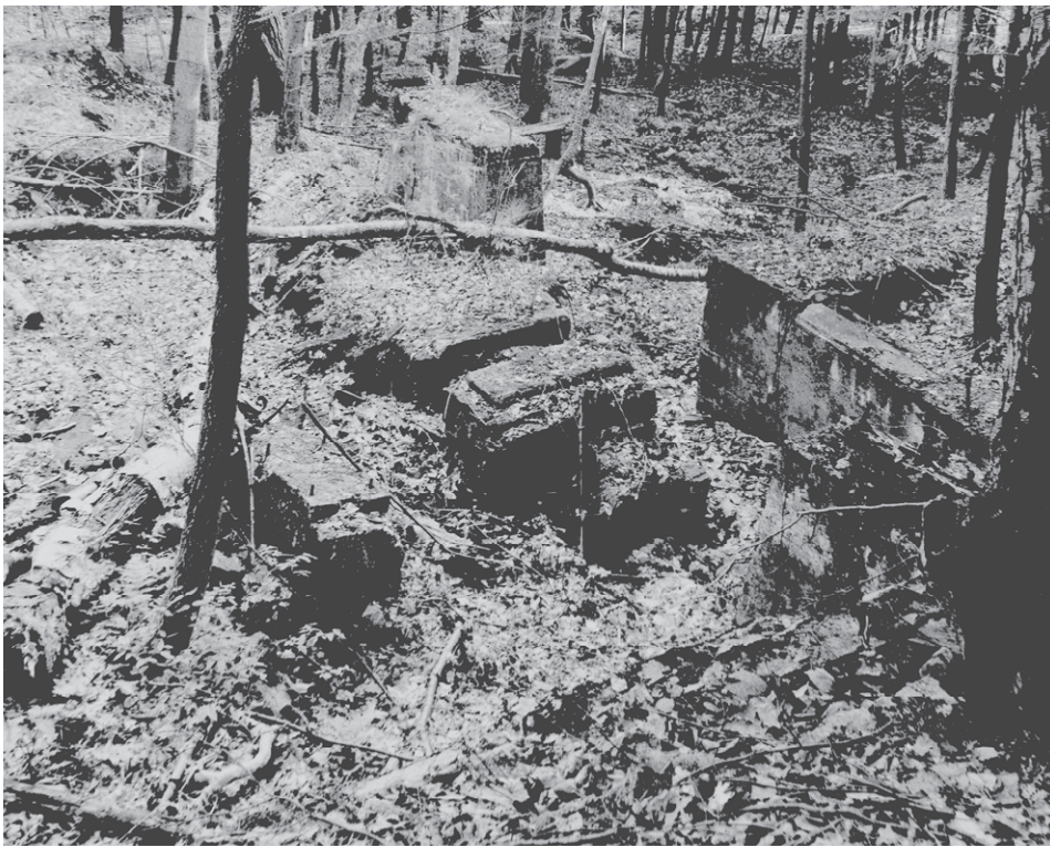
Concentrating mill remains.

industrial processes and existing today as a walking/logging trail connecting the contributing elements within the site. The elevation from the highway to the quarry rises from 343 to 649 feet above sea level.