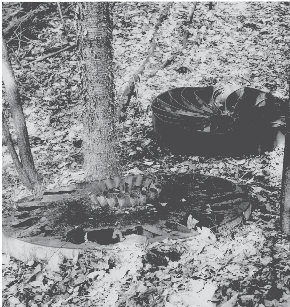
Buddle components at concentrating mill.

Adirondacks was the separation of the flake graphite from its associated gangue minerals without destroying the flakes or unduly reducing them in size. This is difficult as crushing forces small grains of gangue into the graphite. The process calls for long experience and mechanical ingenuity. Numerous failures were attributed to the separation process. In addition, the character of the ore could change as mining operations proceeded. This separation process is divided into two stages: "concentration" and "refining." Most commonly the concentration was performed at the mine site and the refining at another location. GPC was one of only three mines in the southern Adirondack area (the others being the American Graphite Company in Hague and the Flake Graphite Company in Porters Corners) that carried out both separation stages at the mining location (Alling 1917). The separation of ore from gangue was based on the distinctive physical and chemical characteristics of each. Some of these characteristics are differences in specific gravity, electrical conductivity, selective behavior of a mixture of water and oil upon the surface tension or upon the magnetic properties of the ore and gangue material. As a result of the separation process, the lighter graphite material was saved and the non-