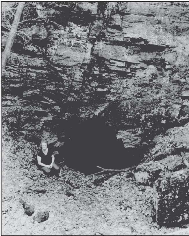
One of twelve drifts (mine openings).

adheres to metal surfaces, it fills the pores and provides protective properties, reducing friction and acting as a lubricant. In a dry application, such as in textile mills where oil would soil the cloth, or for automobiles as lubricating oils and greases (Gwinn, 1943:13). Other uses included dry cell batteries, dynamo brushes, electrodes, steam and water packings, brake linings, and fertilizers. The paint industry made use of the lowest grade of ore, 30-35% purity; with manufacturers of crucibles, pencils and lubricants, 83-97% purity; and electrical component manufacturers consuming the material 97% or higher (Harrison 1955: 2-3).