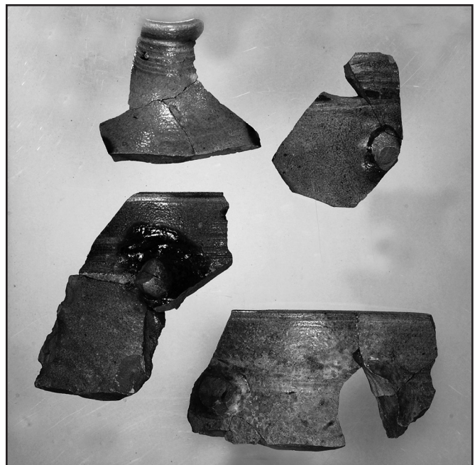
Figure 3. Stoneware Vessel Fragments from Mashantucket Site 72-161. Represented are a jug and three pots with handles whose attachments are painted with cobalt blue slip.