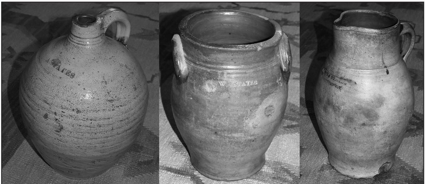
Figure 4. States Family Stoneware from the Old Lighthouse Museum, Stonington Historical Society. Includes a jug by Adam State II, a pot by William States, and a pitcher by Joshua Swan and Ichabod States.

Future excavations at the Adam States II pottery will clarify the technological histories and production processes of the family's stoneware complex and allow us to explore how their work was affected as the industry expanded and became more competitive across southern New England in the 19th century. Studies of museum and archeological collections are also continuing in an effort to understand the geography of the States stoneware complex and its role in the coasting trade around Long Island Sound (and beyond) between the 1770s and the late 1830s.